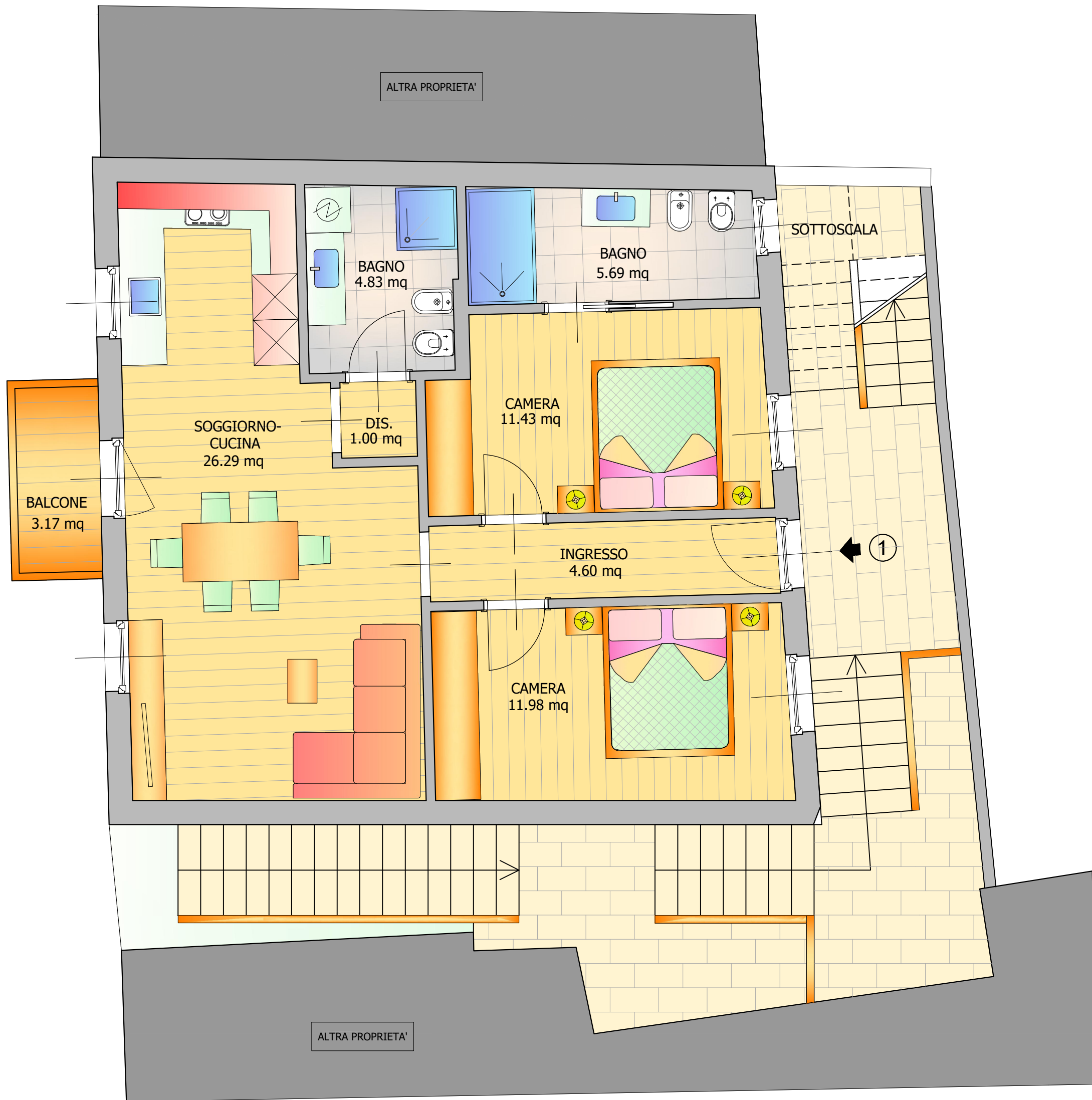
PIANTA PIANO SECONDO SCALA 1:50